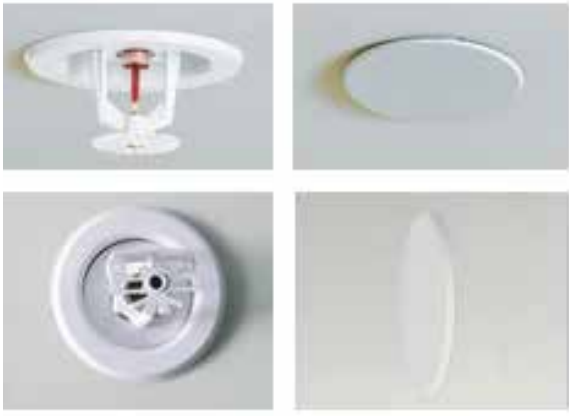
Pendent Sprinkler Concealed Sprinkler Sidewall Sprinkler Concealed Sidewall Sprinkler